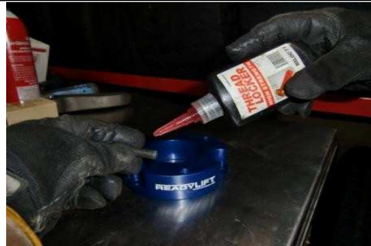
Prepare your T6-5055 Billet aluminum spacer for install by applying thread locking compound to the provided set screws.