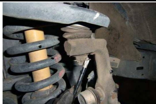
Remove upper ball joint nut retaining clip.