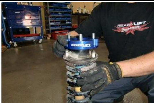
Place strut extension spacer on top of OE coil-over shock and secure with factory hardware.