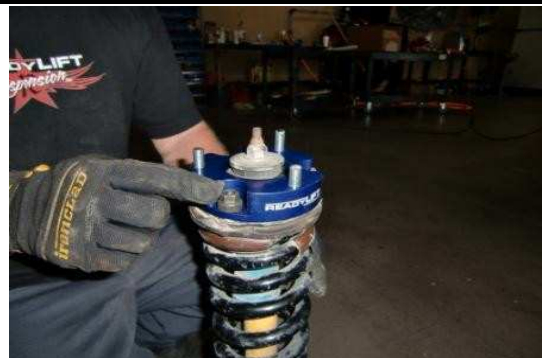
Photo shows factory hardware installed and tightened to factory spec.