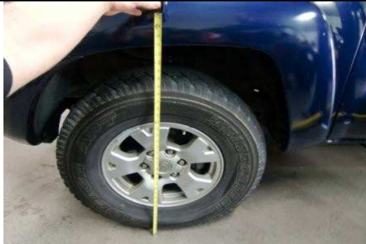
Begin by placing vehicle on level working surface and take an initial measurement.

* Two, minimum 2 ton, jacks are recommended to make installation safe and easier.