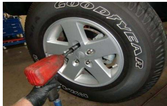
Support vehicle on jack stands and remove front wheels/tires