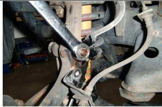
Then remove sway bar endlink nut and remove upper link from spindle, (dr./pass.) note: sway bar has tension from side to side.