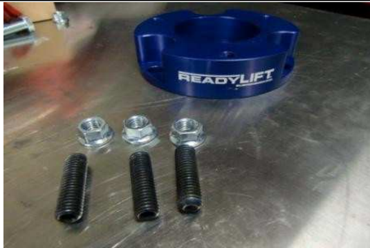
ReadyLift. T6-5055 Billet aluminum spacer kit and hardware. (avail. In 4 colors).

Installation by a trained mechanic is recommended.