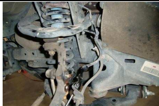
Remove ABS/brake line away from spindle and arm as shown to allow suspension to droop and not damage lines