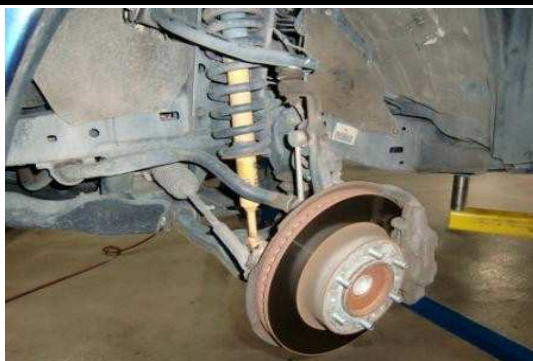
View of front suspension (driver side Shown).