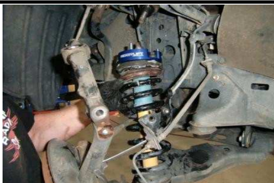
Reinstall coil-over assembly back into factory position at 180 degrees of rotation so the bottom mount lines up.