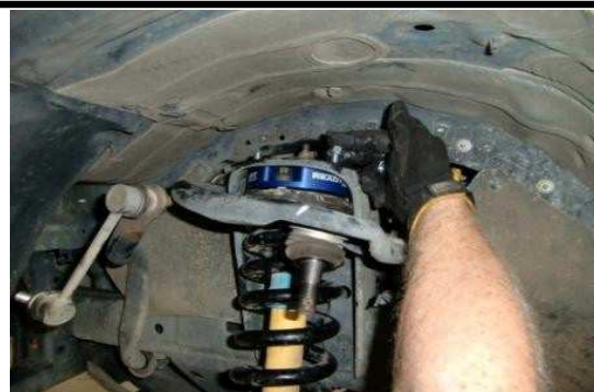
Attach coil-over assembly at the top with provided hardware and torque to factory specs. Reattach all removed hardware in reverse order and secure vehicle on ground.