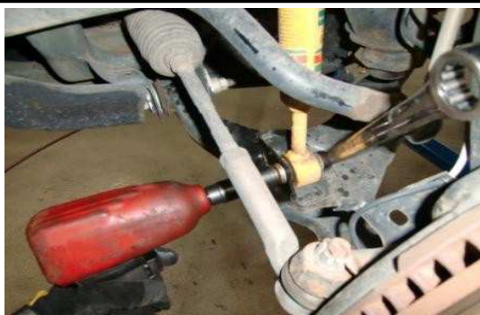
Loosen lower coil-over shock nut and remove bolt. .