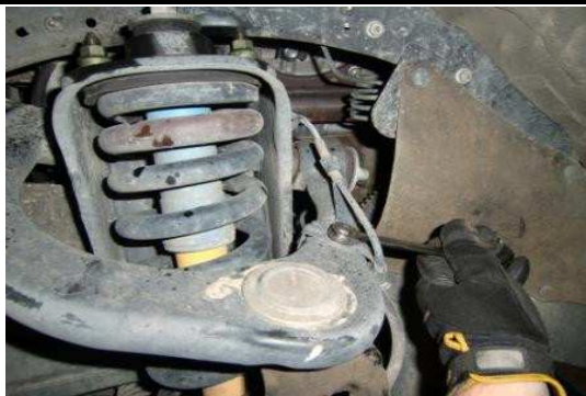
Remove ABS/brake line bracket from upper control arm.