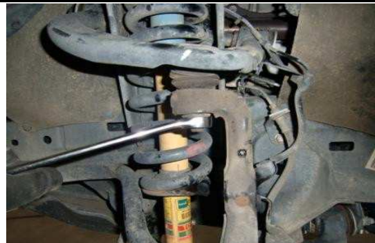
Loosen upper ball joint nut, but do not remove. Leave 3-5 threads attached.