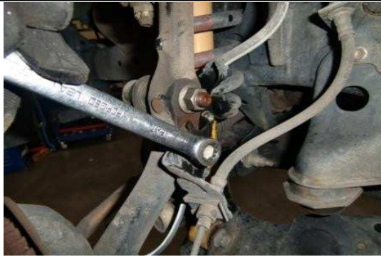
Next, remove ABS/brake line bracket from spindle.

Installation by a trained mechanic is recommended.